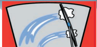
Snow build-up under wiper causes streaking.