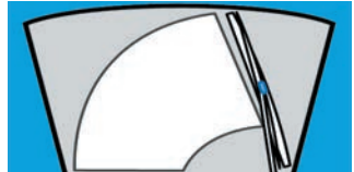
The SHAKER improves visibility.