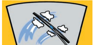
The SHAKER vibrates your wiper, removing snow build-up.