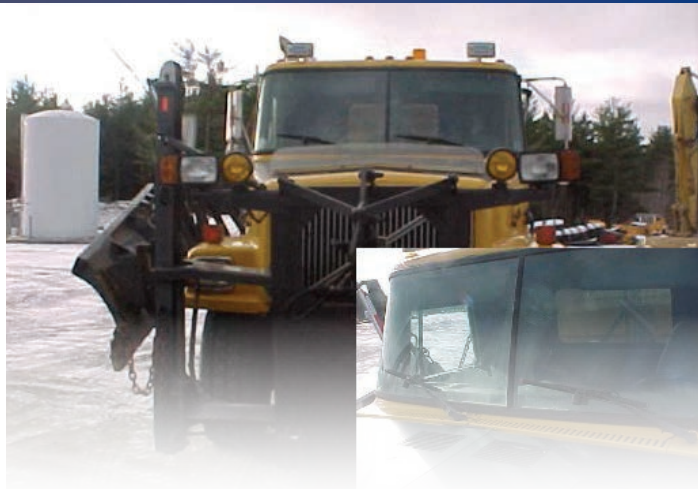
As installed on a Nova Scotia DOT Plow